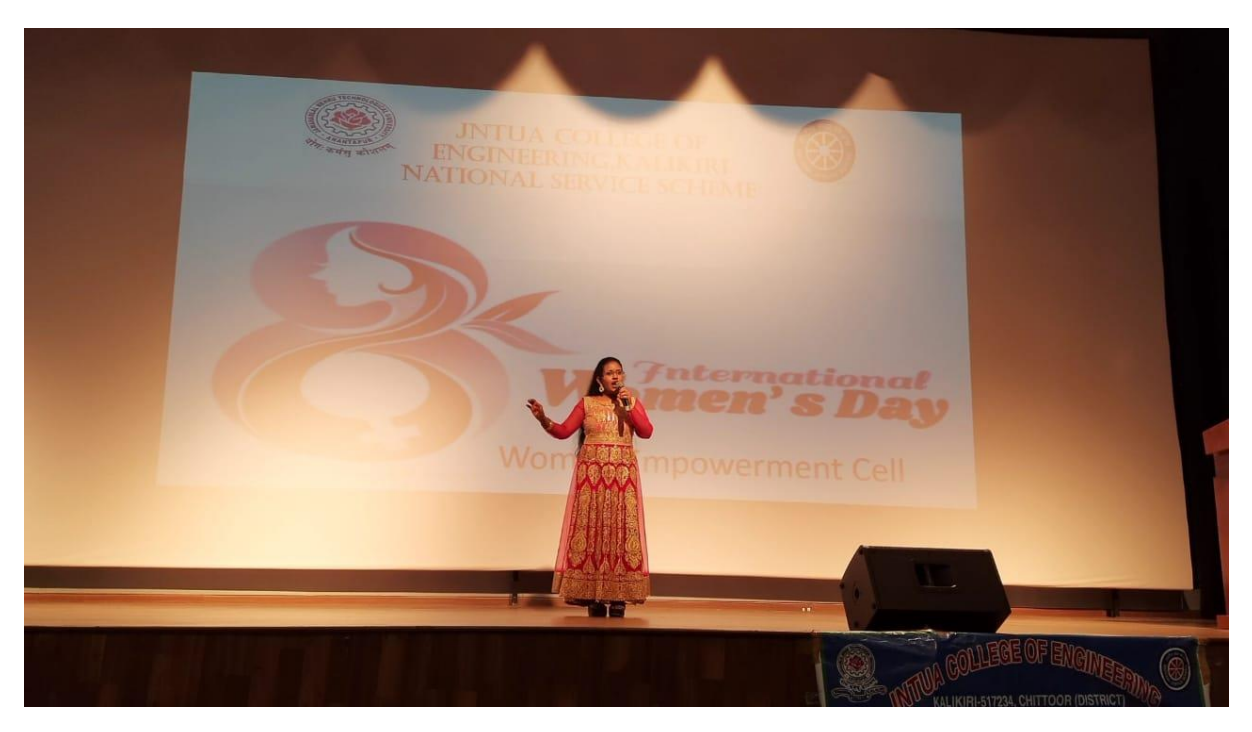
Student from I Year

The event had ended with the prize distribution to the winners and runners of all competitions.