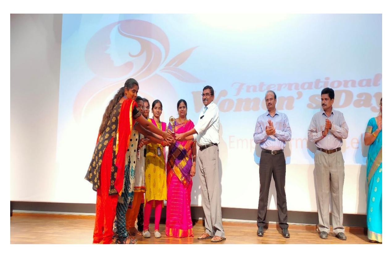
Sports runners (Throw ball)- CSE