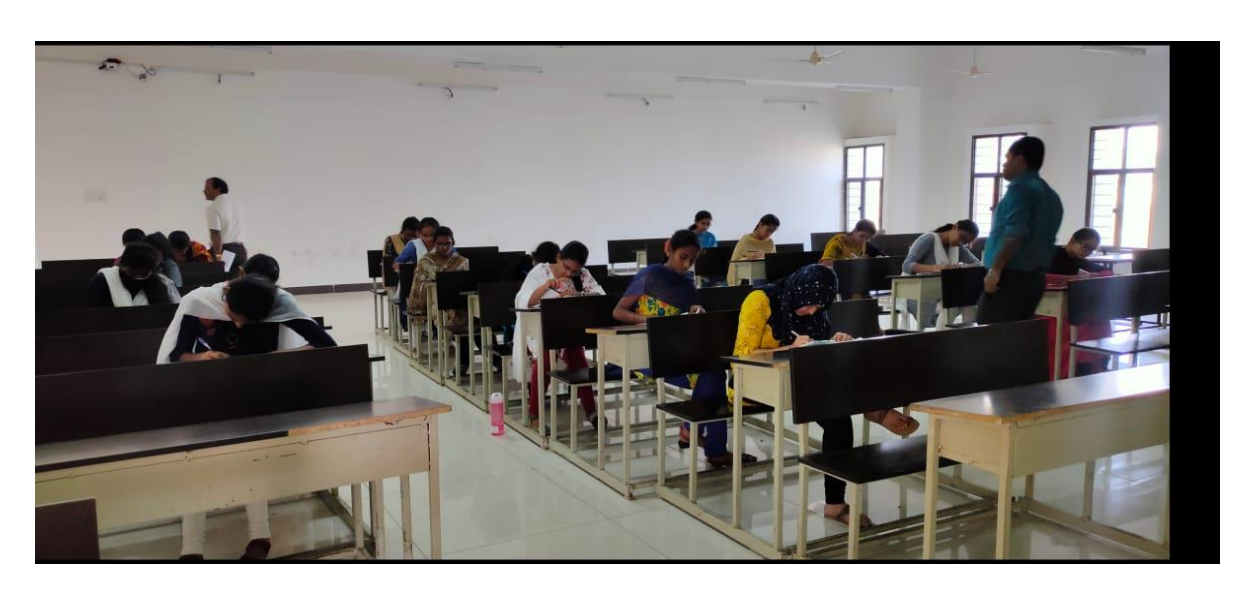
Essay Writing Competition