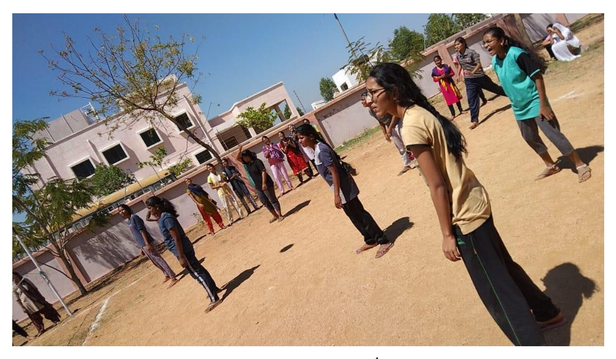
Throw ball conducted on 5<sup>th</sup> March 2021

The event has started with a rally in which all the women students and women faculty including NSS volunteers participated.