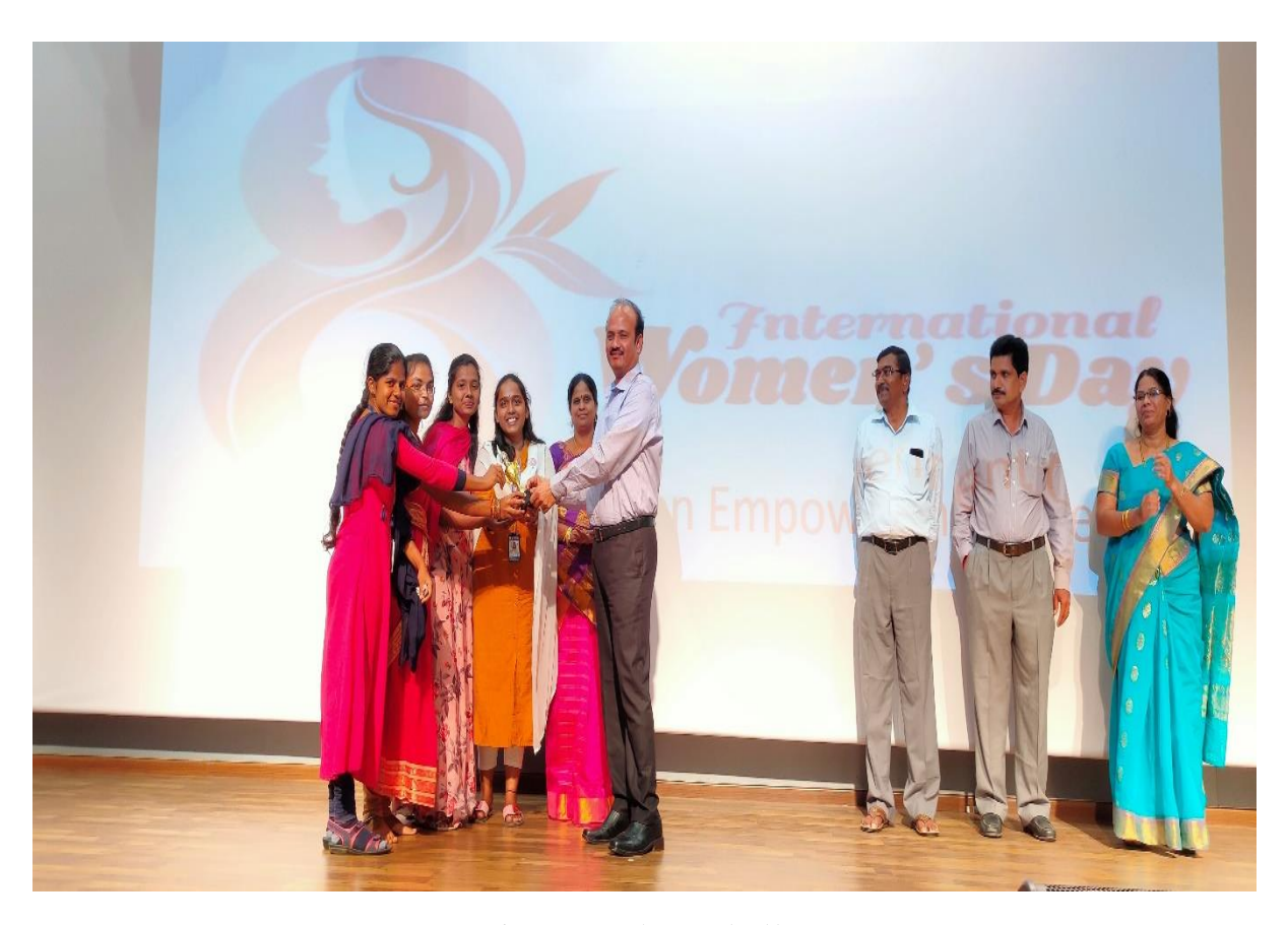
Sports winners (Throw ball)- CIVIL